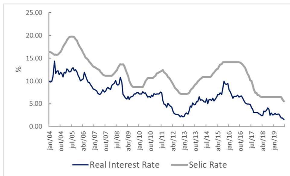
Table 1 - Selic and Real Rate

Laubach and Williams (2003) focus their work in estimating the real interest rate – the real interest rate consistent with output equalizing potential and stable inflation – on a medium-run concept of price stability that not considers the effects of short-run price and output fluctuations. Their purpose is to show that the time variation in natural interest rate is important to the analyses and the performance of monetary policy and its real-time mismeasurement can cause a significant deterioration in macroeconomic stabilization.